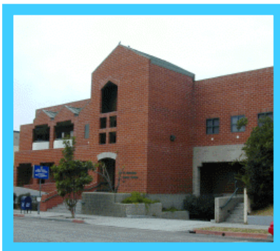
St. Barnabas Senior Center Los Angeles, CA

A few communities have built new facilities or made local investments but most centers are aging and lack important upgrades. A 2010 study revealed that: